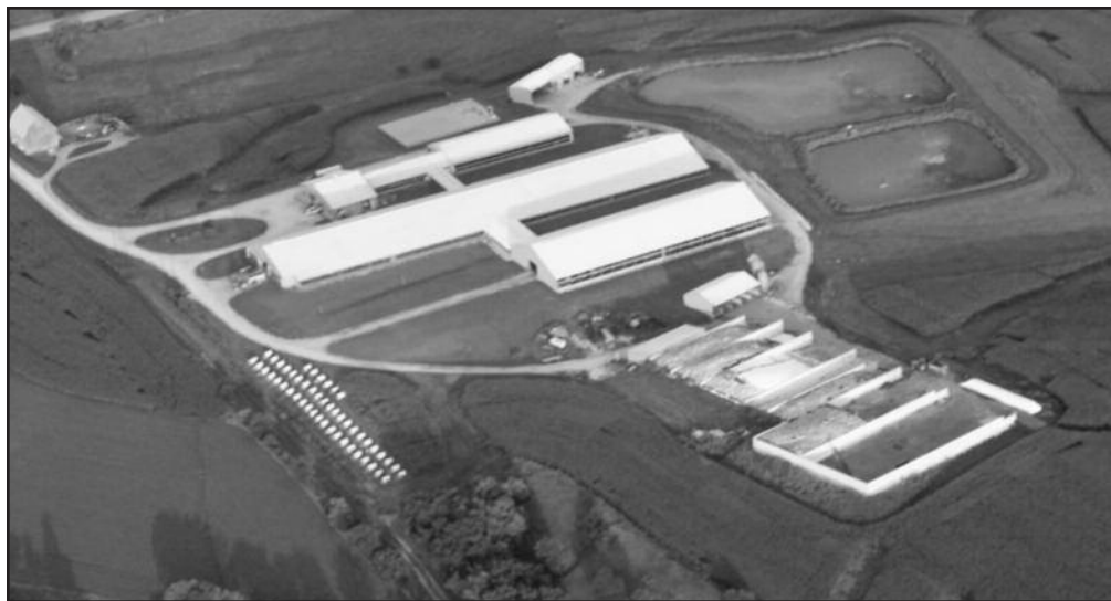
Aerial view of Hunter Haven Dairy.

For those wanting to car-pool to this event we will meet up at the extreme southeast corner of Cherryvale Mall (south of Sears) at 9:15 a.m. that Saturday morning. Please contact John Paulsgrove at 815-871-4416 or 815-332-5580 if you plan to car-pool or need more details. The farm is located on Hwy. 73 four miles south of Pearl City (travel west on Hwy. 20 to Hwy. 73) and is about a 1¼ hour drive from Cherryvale Mall.